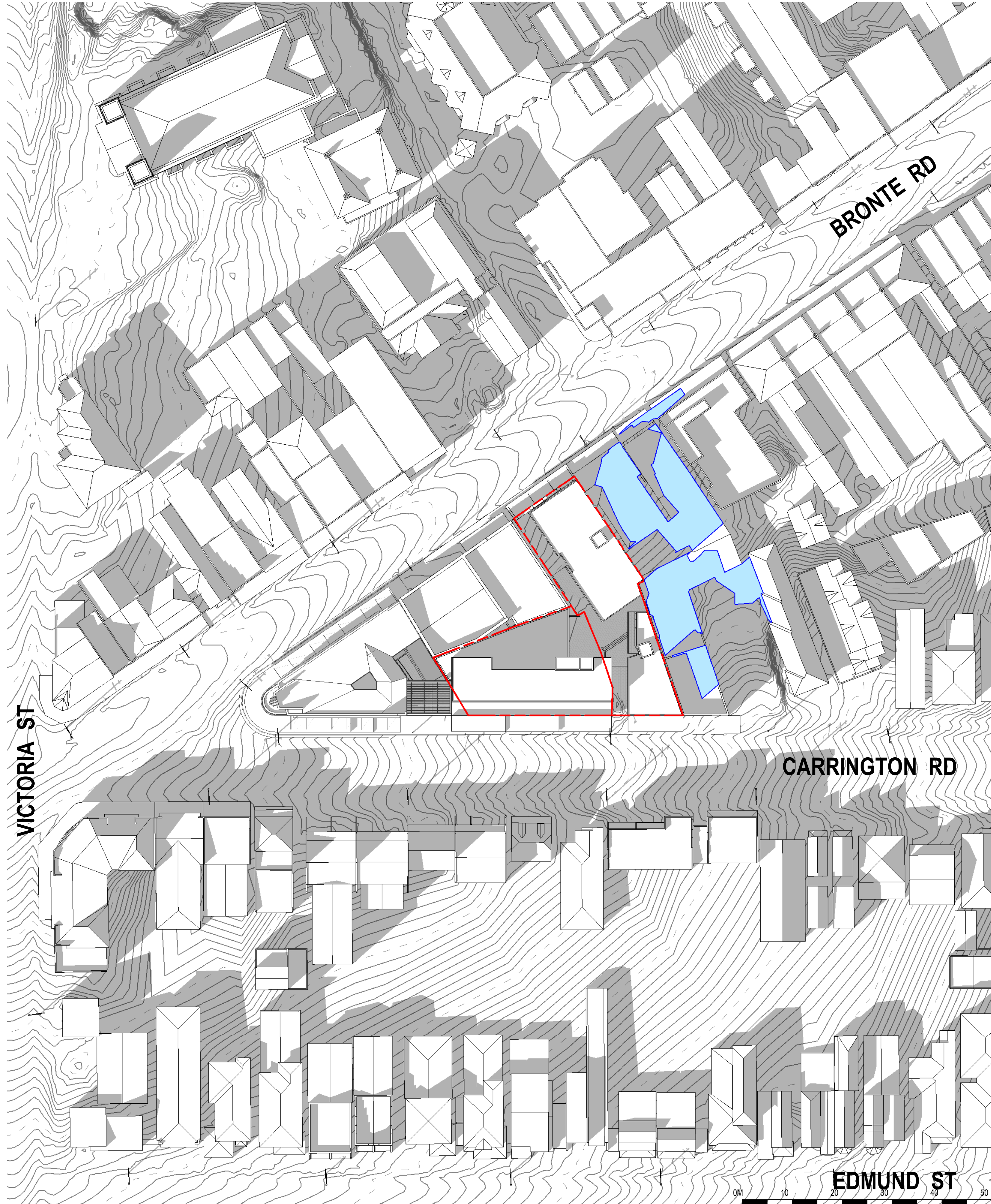
2 Shadow Plan - Proposed - Winter Solstice 2:00PM 1 : 500