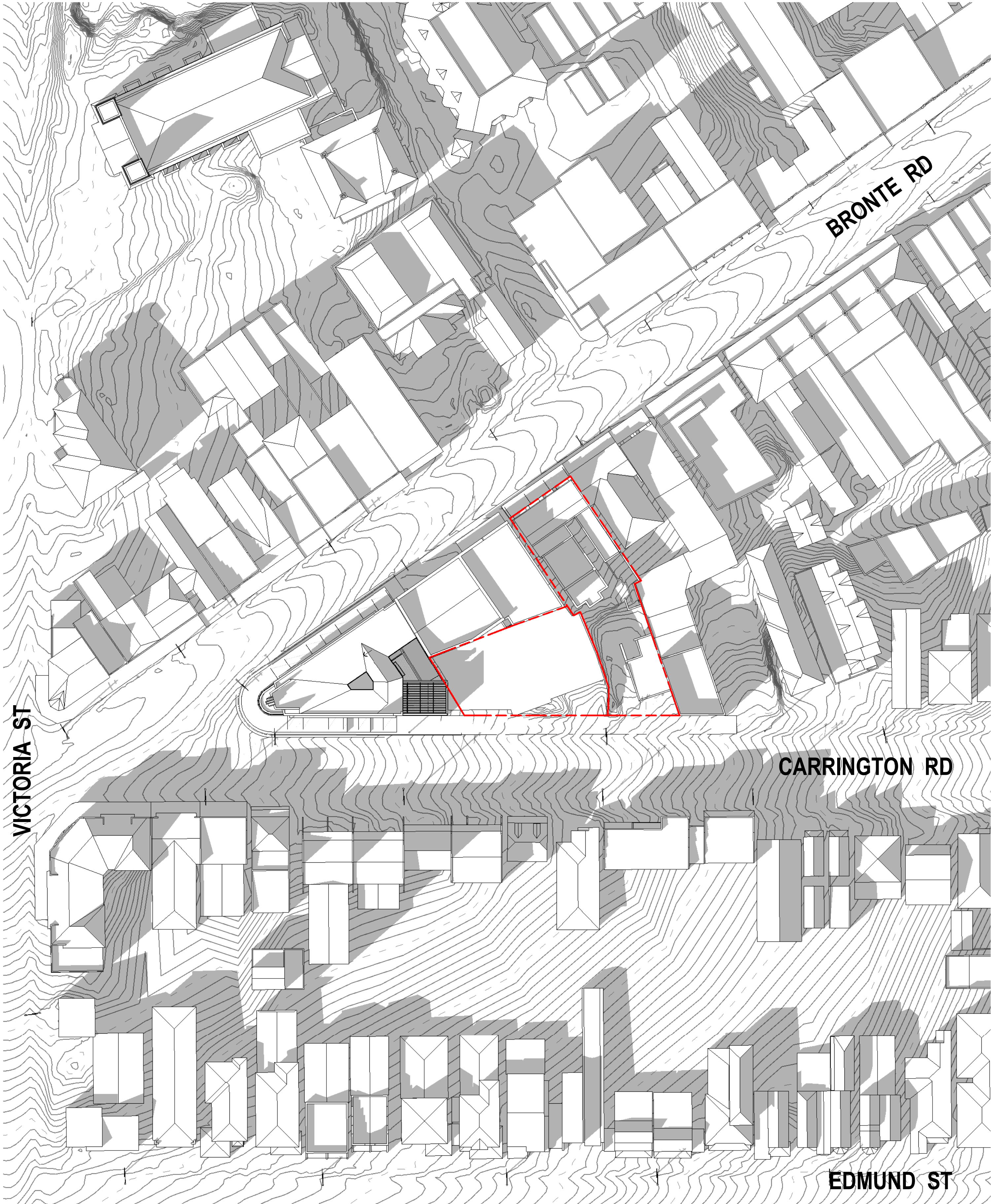
1 Shadow Plan - Existing - Winter Solstice 2:00PM 1 : 500

General Notes The copyright of this design remains the property of H&E Architects. This design is not to be used, copied or reproduced without the authority of H&E Architects. Do not scale from drawings. Confirm dimensions on site prior to the commencement of works. Where a discrepancy arises seek direction prior to proceeding with the works. This drawing is only to be used by the stated Client in the stated location for the purpose it was created. Do not use this drawing for construction unless designated.